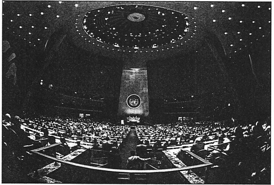
PrepCom3 brought together anti-natalists and pro-aborts from around the world

The outcome of PrepCom3 and, ultimately, of the Population Summit, was apparent with the appointment of the two top ICPD honchos, Dr. Nafis Sadik of Pakistan and Dr. Fred Sai of Ghana. Dr. (Mrs.) Nafis Sadik, secretary-gen-