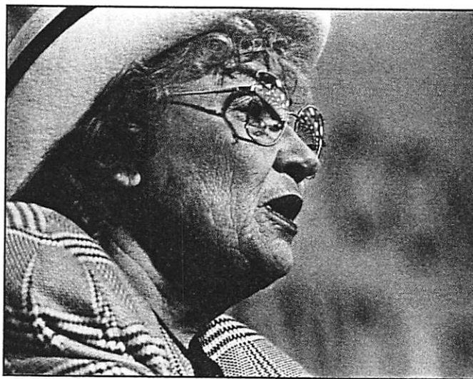
Abzug capably represented militant feminist contingent